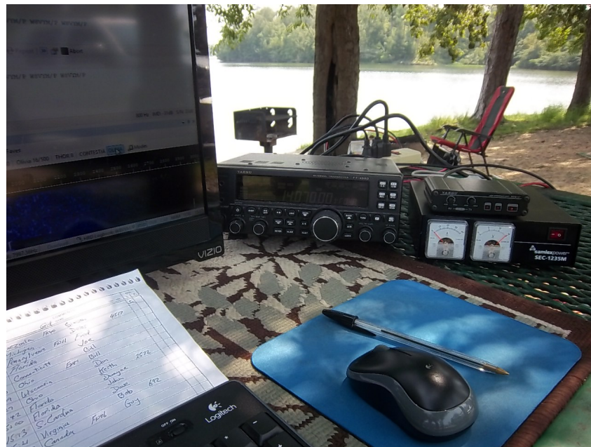
Picnic Table Station Setup

After tweaking the macros with the new location, callsign and inserting the APE verbiage, I started transmitting at about 2345Z 13AUG2018. My first contact was with YV1SW (Sixson) in Venezuela...599 both ways! I made 3 other contacts and then at about 0040Z 14AUG2018 I was forced to shut the station down due to a sudden squall coming from behind me. Jean (XYL) came to my aid with a raincoat and umbrella. Raincoat went over the radio, interface, and power supply. Umbrella was unable to take the wind and folded up immediately. Computer and