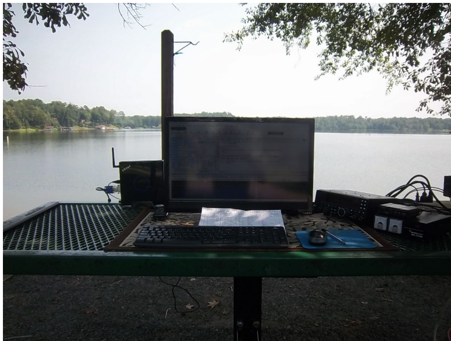
W8VYM/P Picnic Table Setup

Arrived at Arrowhead Campground (EM82ct) at about 13:45L on 13 Aug 2018. I usually set up the radio next to the camper under the awning, however, our camping spot was such that I was unable to set the table up next to the camper due to a wooden perimeter surrounding the pad. The next best option was to setup (uncovered) on the picnic table.