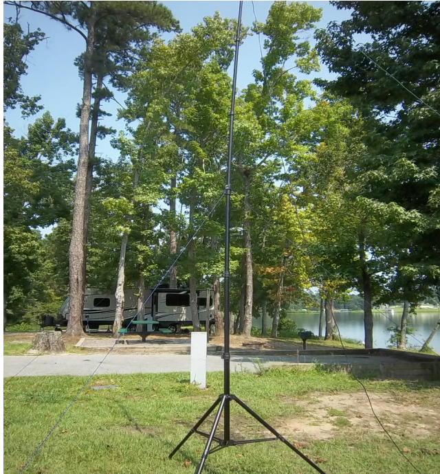
Buddipole Set up and Ready to go

3. Power for the station was supplied via a standard 110 VAC external outlet/extension cord from the camper.