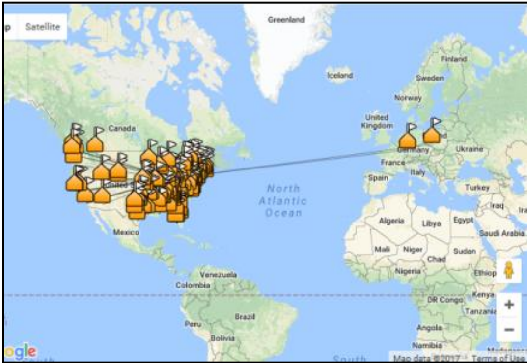
Map of 2017 KC9UR Pontoon Portable APE Contacts (map by K2DSL web application at www.levinecentral.com/adif2map/ )