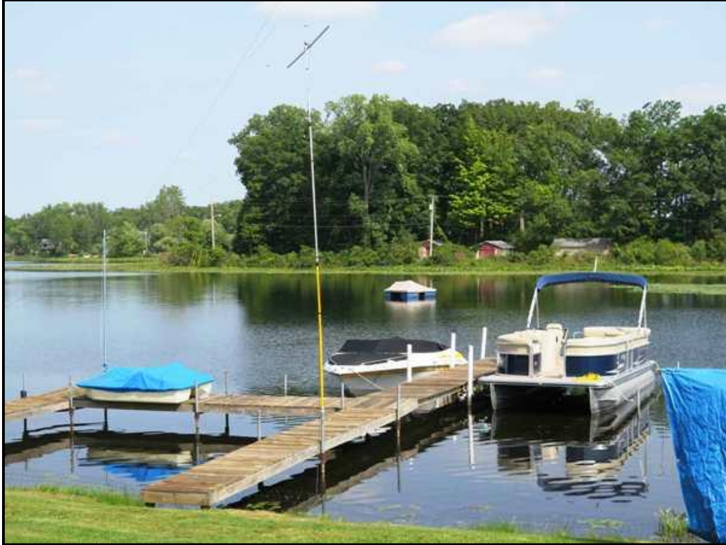
View of Stan's pier showing the 6m antenna and the pontoon boat.

For those interested in a bit of the technical details, here's the info: